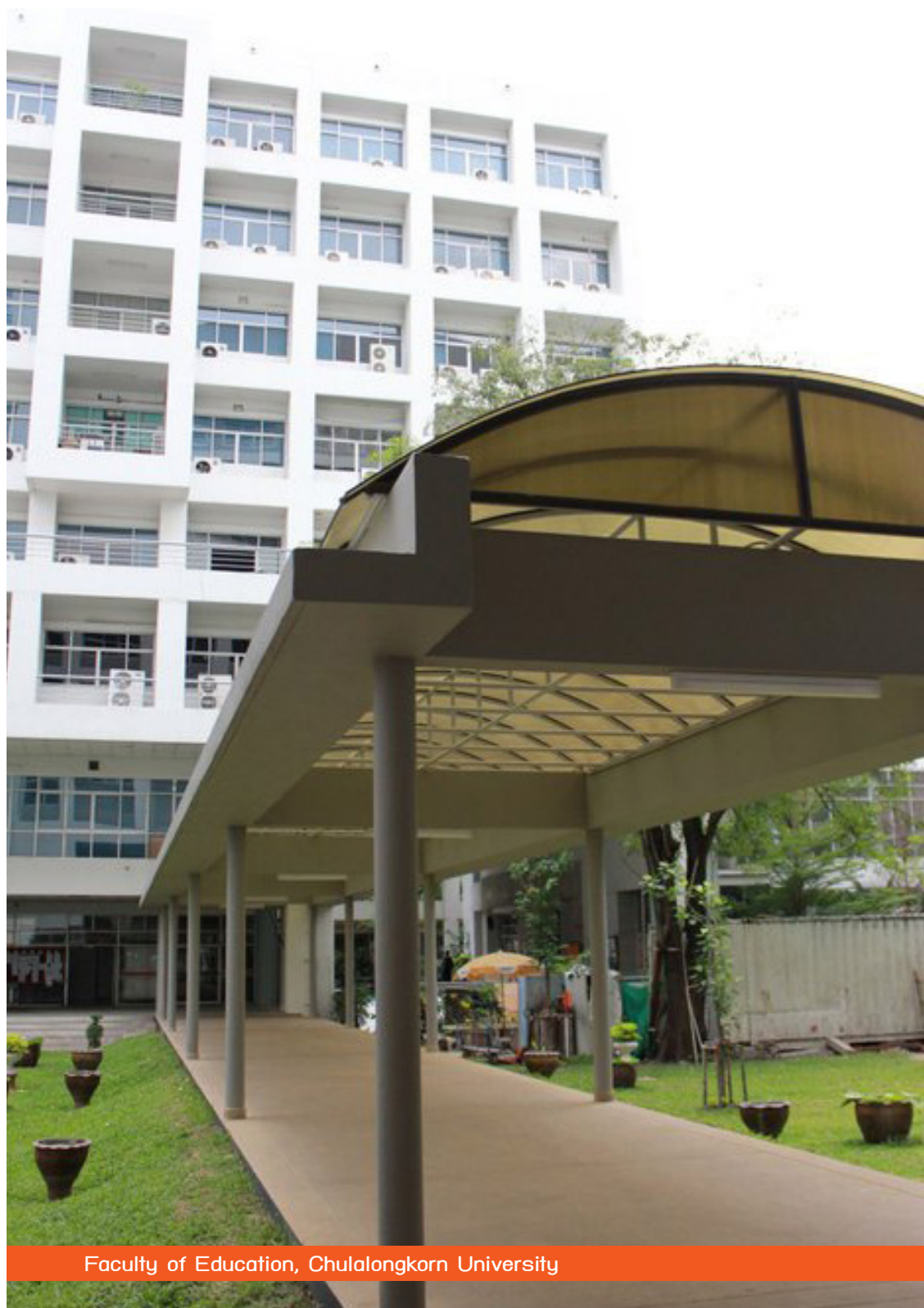
Faculty of Education, Chulalongkorn University